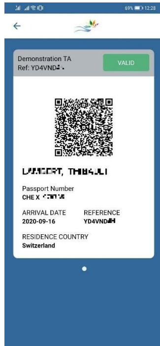
Mobile app version: