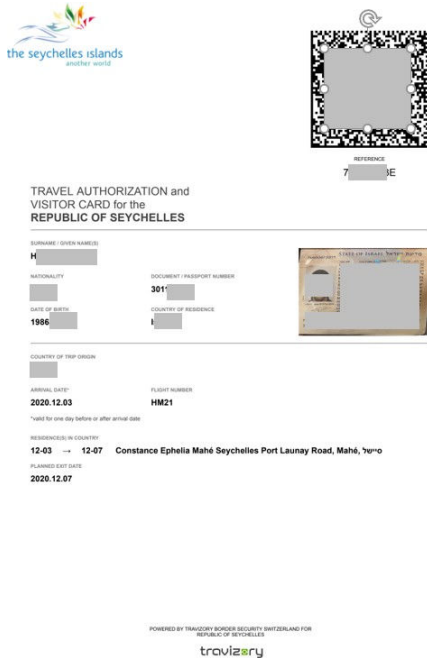
Paper / PDF version: